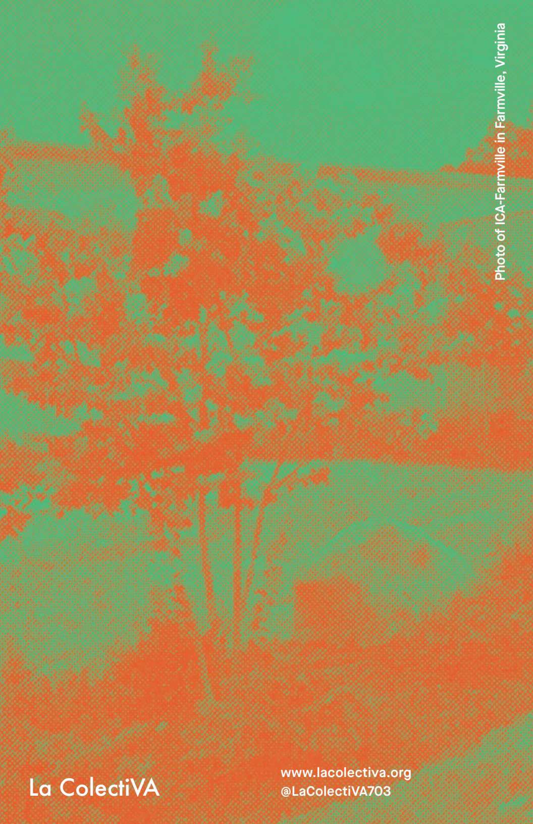
Photo of ICA-Farmville in Farmville, Virginia